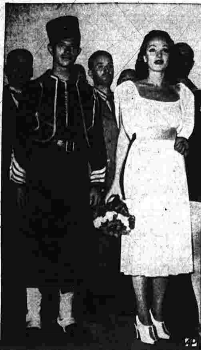
STREETS OF PARIS—A French audience cheered when Marlene Dietrich, German-born, appeared in Paris. "Molotov" is a well-known Parisian. Min Dietrich is now a naturalized American citizen.