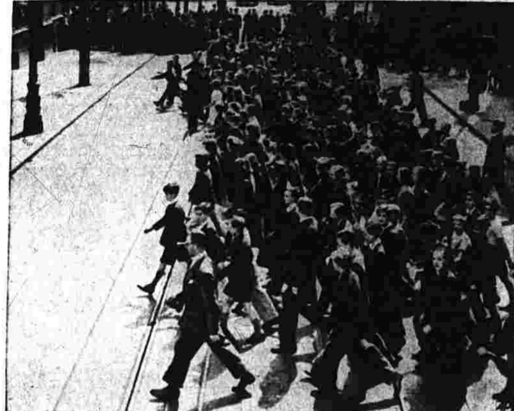
LONG MAY IT WAVE—London school children demonstrate a new "war" crossing, adopted because long double-file processions tied up traffic. Pupils march at curb, cross on signal.